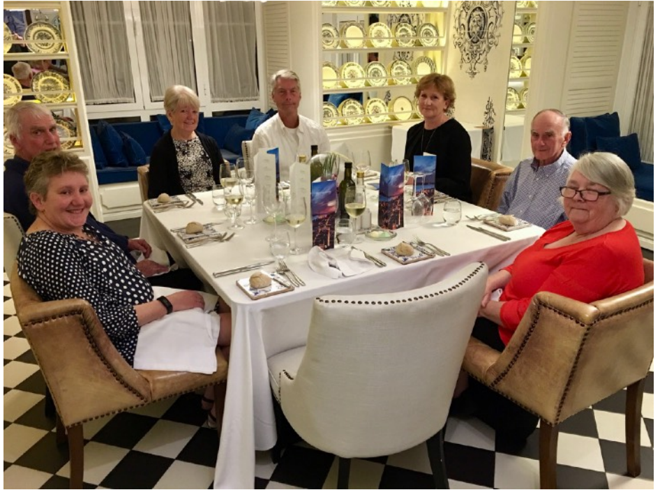
Members enjoyed fine dining in Lisbon.