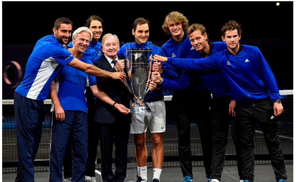
Victorious Team Europe with Rod Laver

This event was a great TV spectacle with Federer and Nadal playing doubles together for the first time with the players from each team offering visible support to their player at each change of end. The next event will be in Chicago in September 2018.