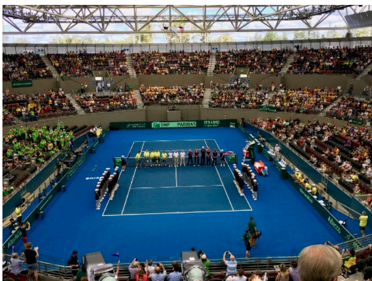
Australia defeats USA at the Pat Rafter Arena in March 2017.