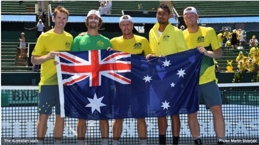
Australia defeats Czech Republic at Kooyong.