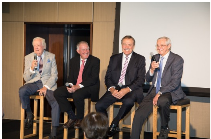
Fred Stolle, Tony Roche, John Newcombe and Roy Emerson share a joke. at the AO Luncheon.