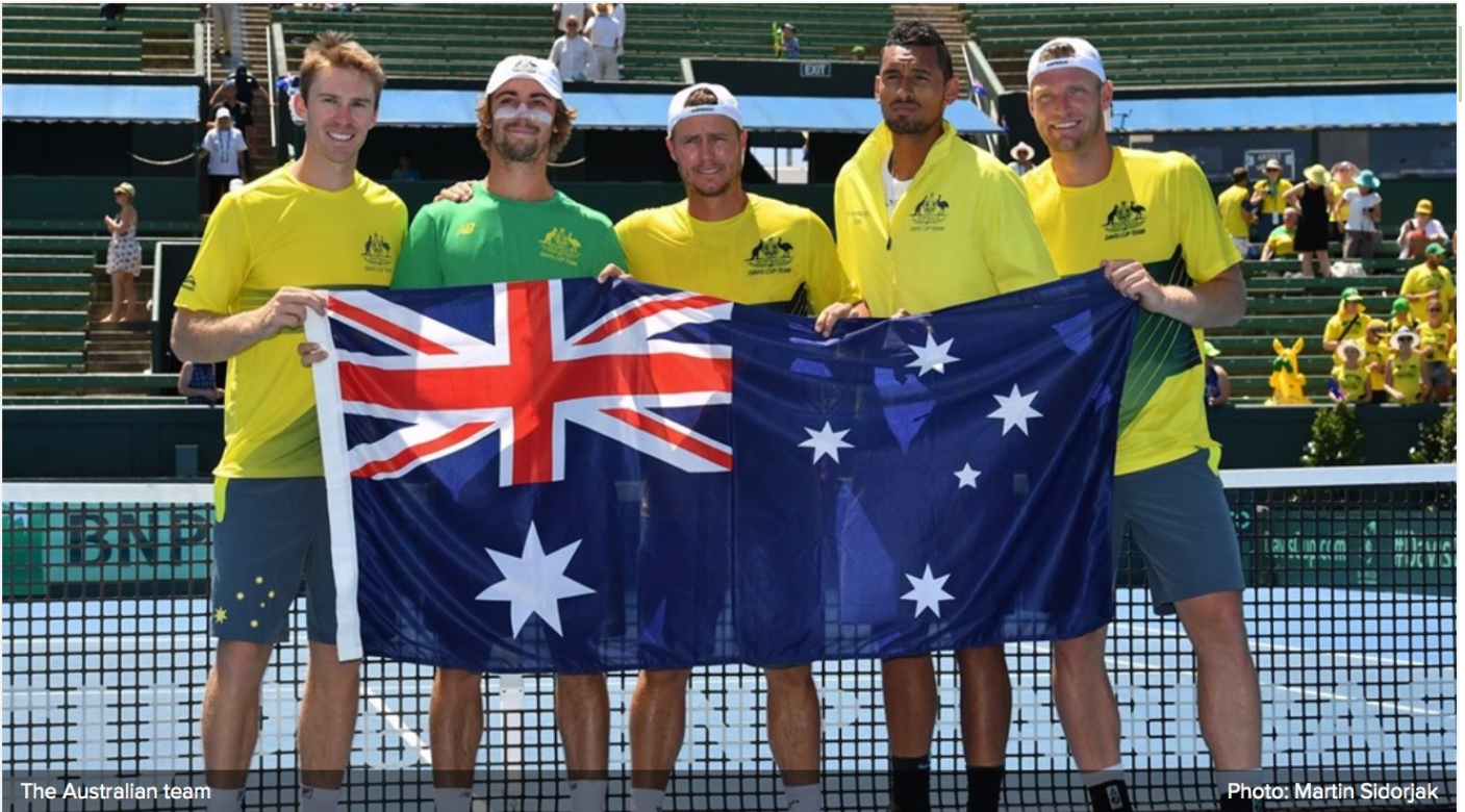
The Australian team