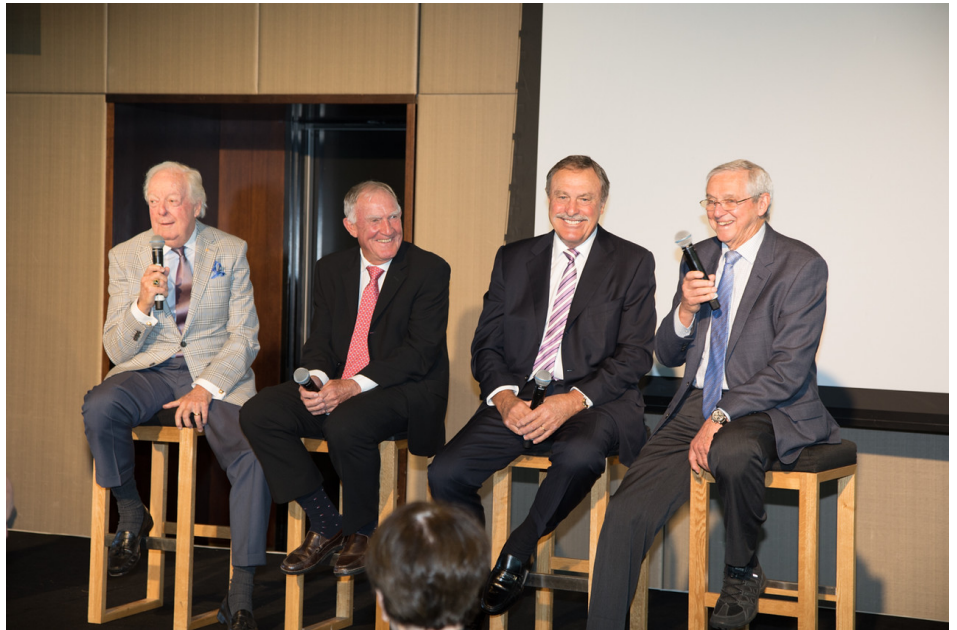
Fred Stolle, Tony Roche, John Newcombe and Roy Emerson share a joke.

Next year we plan to celebrate the 1966 and 1967 Davis Cup victories.