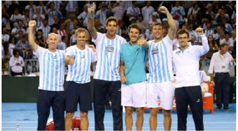
Argentina celebrate their victory over Great Britain.

Croatia advanced to the Davis Cup final for only the second time with an unassailable 3-1 lead over the French. Croatia won the title in 2005.