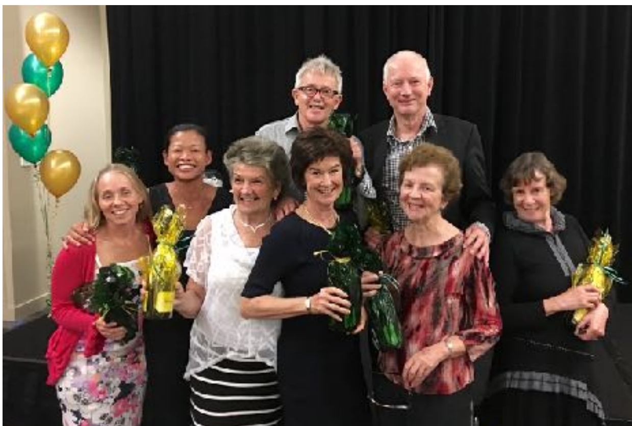
Table "Rod Laver" celebrate their win in the trivia competition.