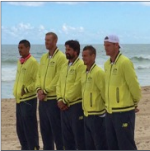
Australia beats Uzbekistan at Cottesloe Beach in Perth.