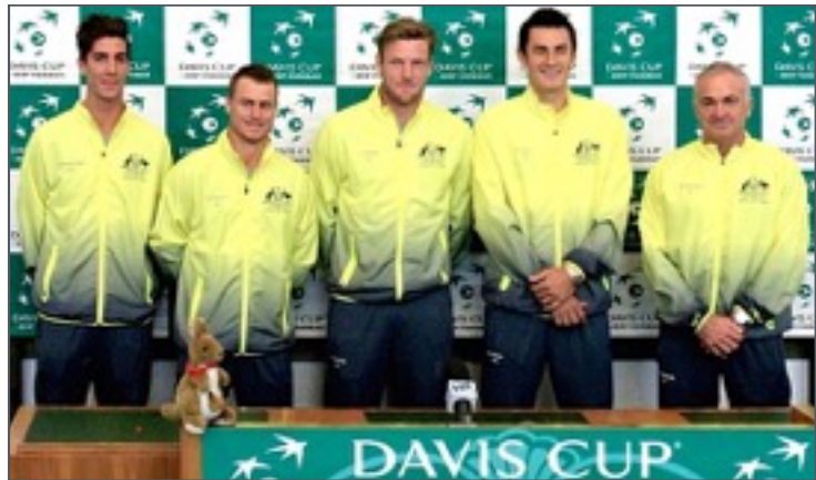
The Davis Cup team in the Czech Republic.