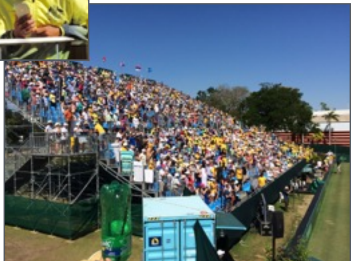
The stands are full in Darwin.