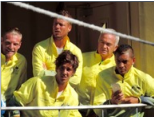
The Davis Cup team in Darwin.