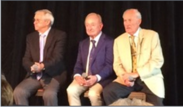
Emerson, Laver and Fraser at the AO Luncheon.