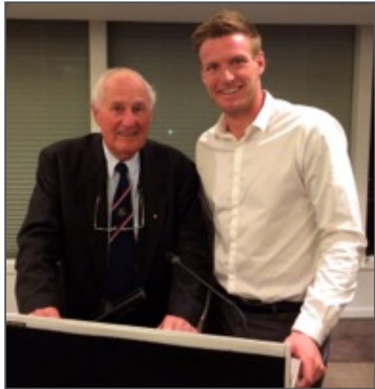
Sam Groth is guest speaker at the AGM.