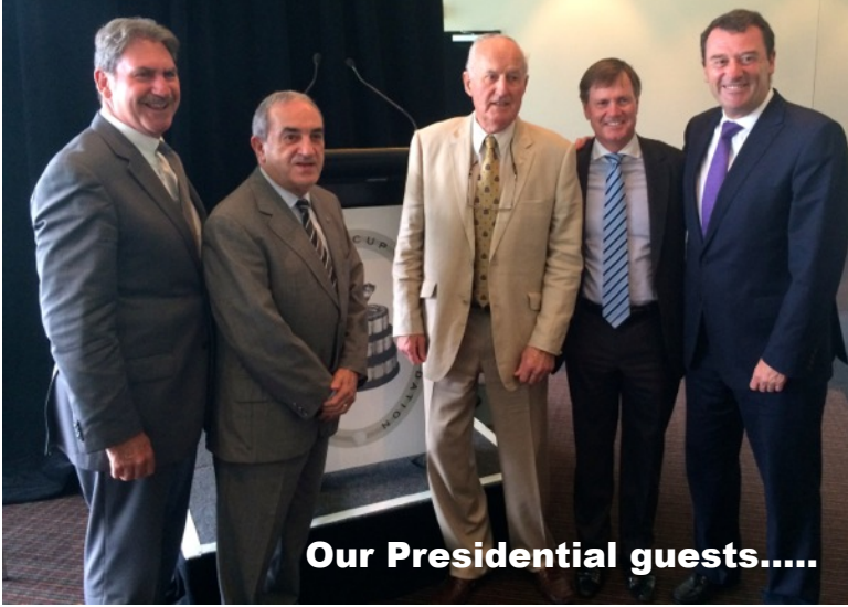
Our Presidential guests.....