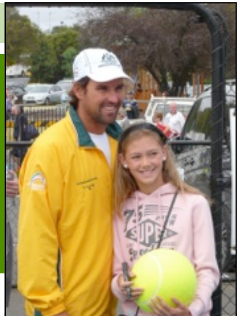
Pat Rafter - always happy to acknowledge the fans.

Australia secured its World Group play-off match against Germany with a comfortable 5-0 victory over Korea in Brisbane. ADCTF members held a dinner on the Saturday evening and were pleased to have Todd Woodbridge and Matt Ebden attend the function.